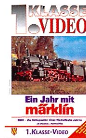
Annual Chronicle for 2004 "A Year with Märklin".