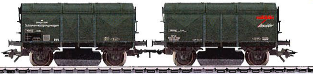
46010 Track Cleaning Car "10 Years Insider" (H0).