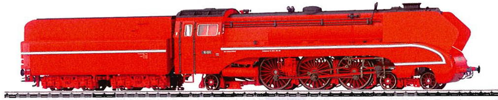
37082 Express Steam Locomotive (H0).