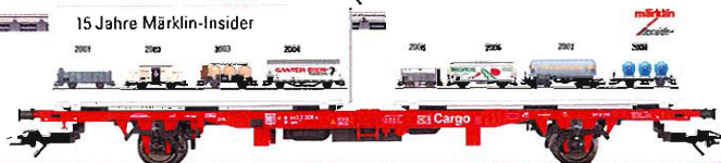
15 Jahre Märklin-Insider