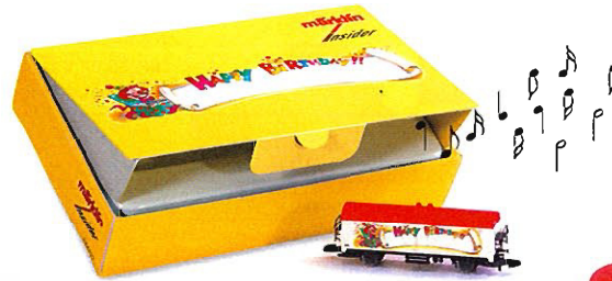
86002 Birthday Car (Z).